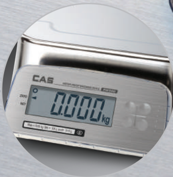
^ Rear display