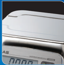
Stainless Steel Tray